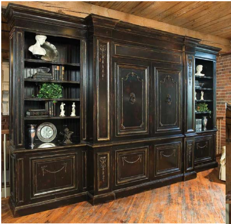
Augustine Bed with Bookcase (57-9000) (left and bottom)- The fabulous and functional Augustine Bed with Bookcase -- shown left closed and below open --offers a wonderful new twist on the Murphy bed concept. Tuck away your sleeping quarters with flair with this ornate design. Shown in Empire Studio Finish and available in any of Habersham's hand-painted finish options.